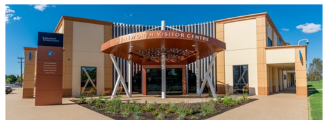
Wentworth Visitor Centre (Main Administration Office) 61 Darling Street, Wentworth NSW 2648